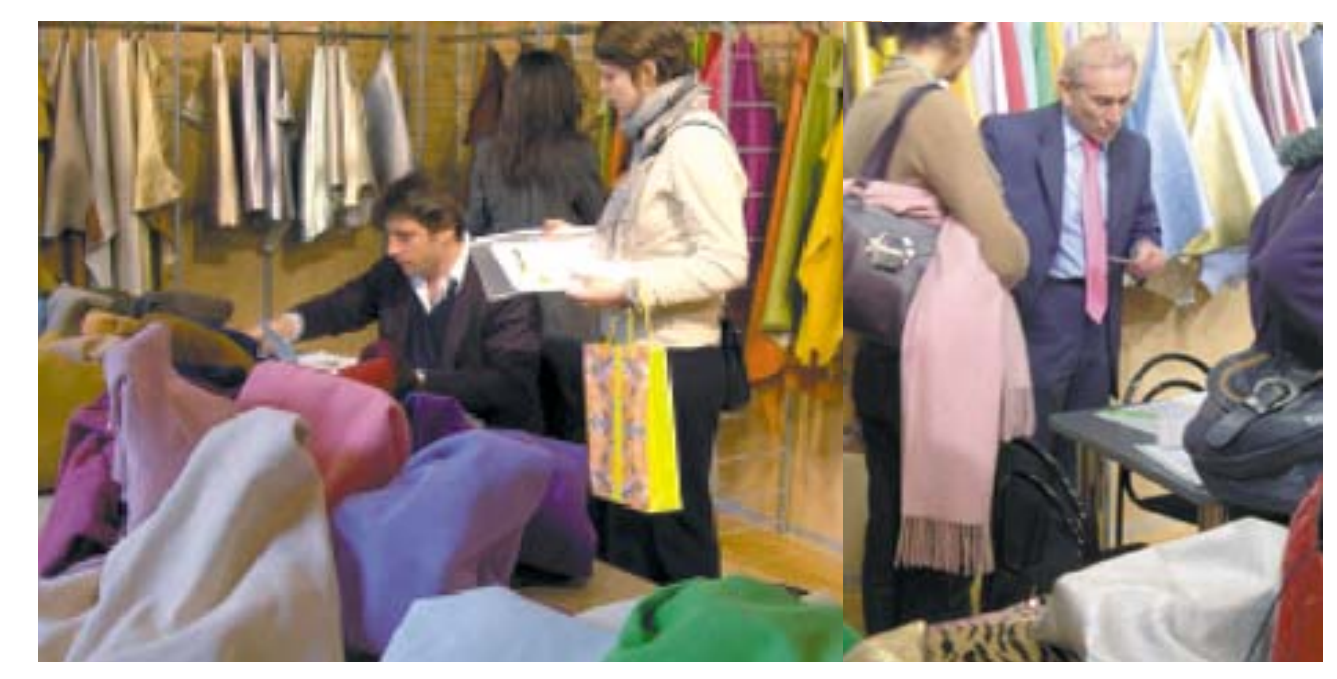
Skin colour swatches at the tannery Russo di Calandrino. On the right, Sicerp at Trend NY patent and laminated leathers for next Summer collections

Probably in Milan the buyers will chose differently, but some analogies will occur. One in particular: the need for a new product that will trail the consolidated work too. The bait effect is nowadays a market rule.